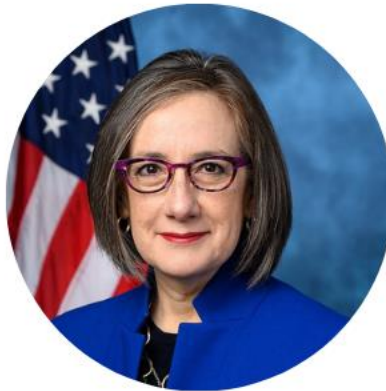
Rep. Andrea Salinas U.S. House of Representatives